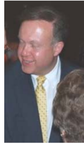
Judge Jim Shriver